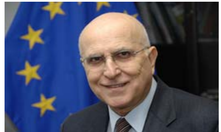
S Dimas, Feb 2008

“Better decisions from local to European level need better and more timely information, based on more efficient monitoring and reporting systems”